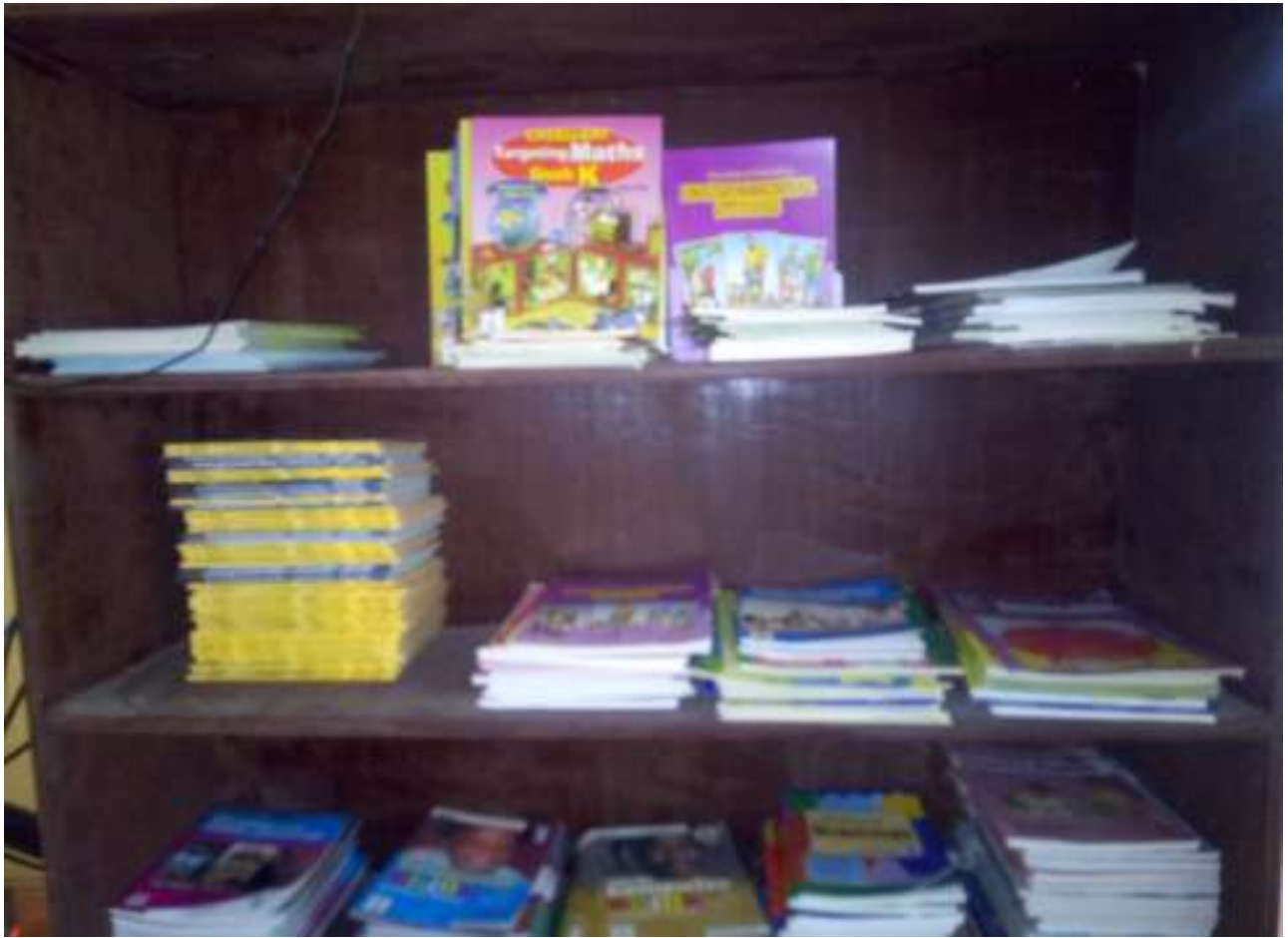
Reading Books provided by Ghanaman Trust Fund to Anakum Primary/JSS in the Western Region