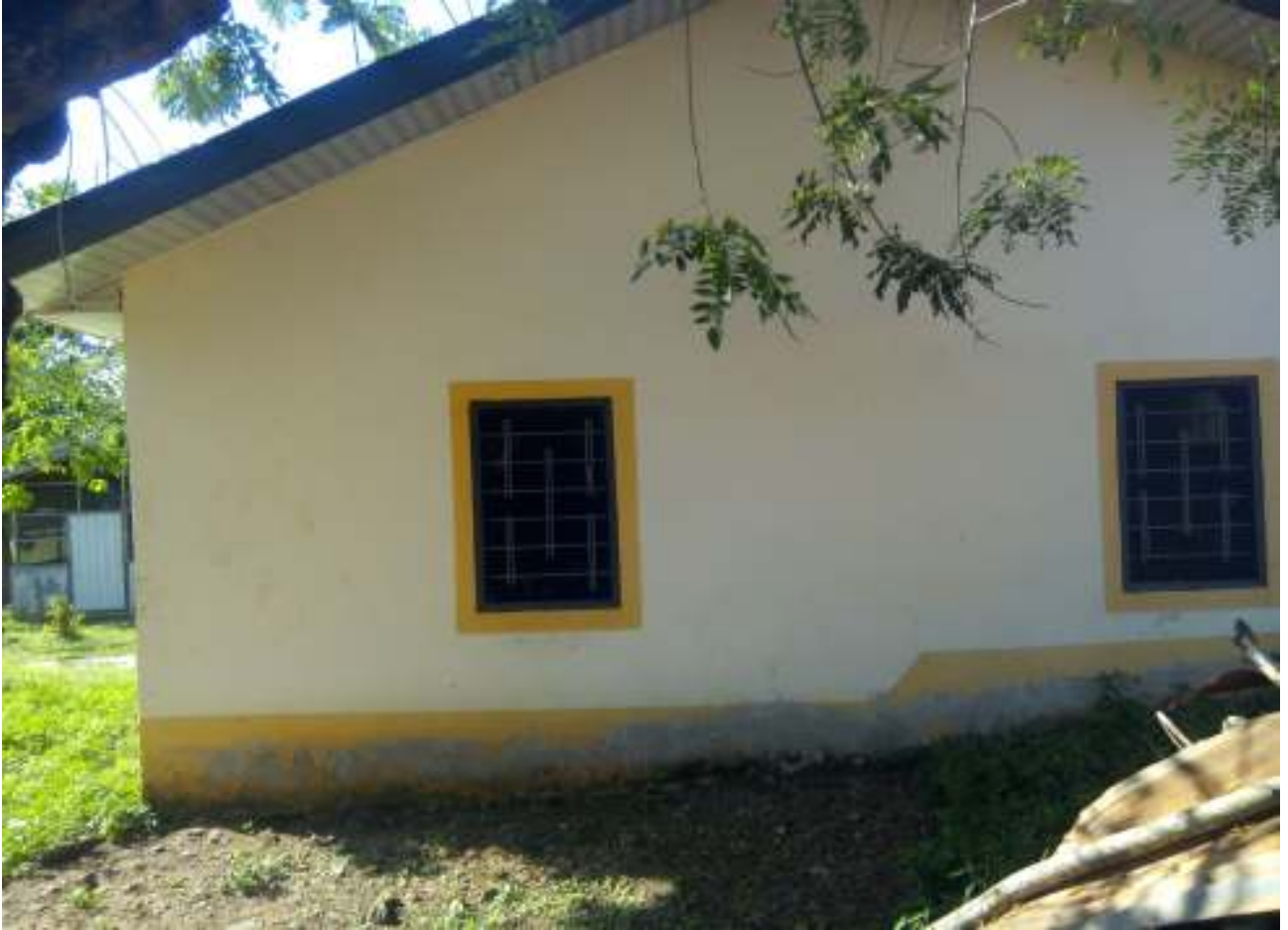
Adankraja CHIPs compound, Bekwai in the Ashanti Region