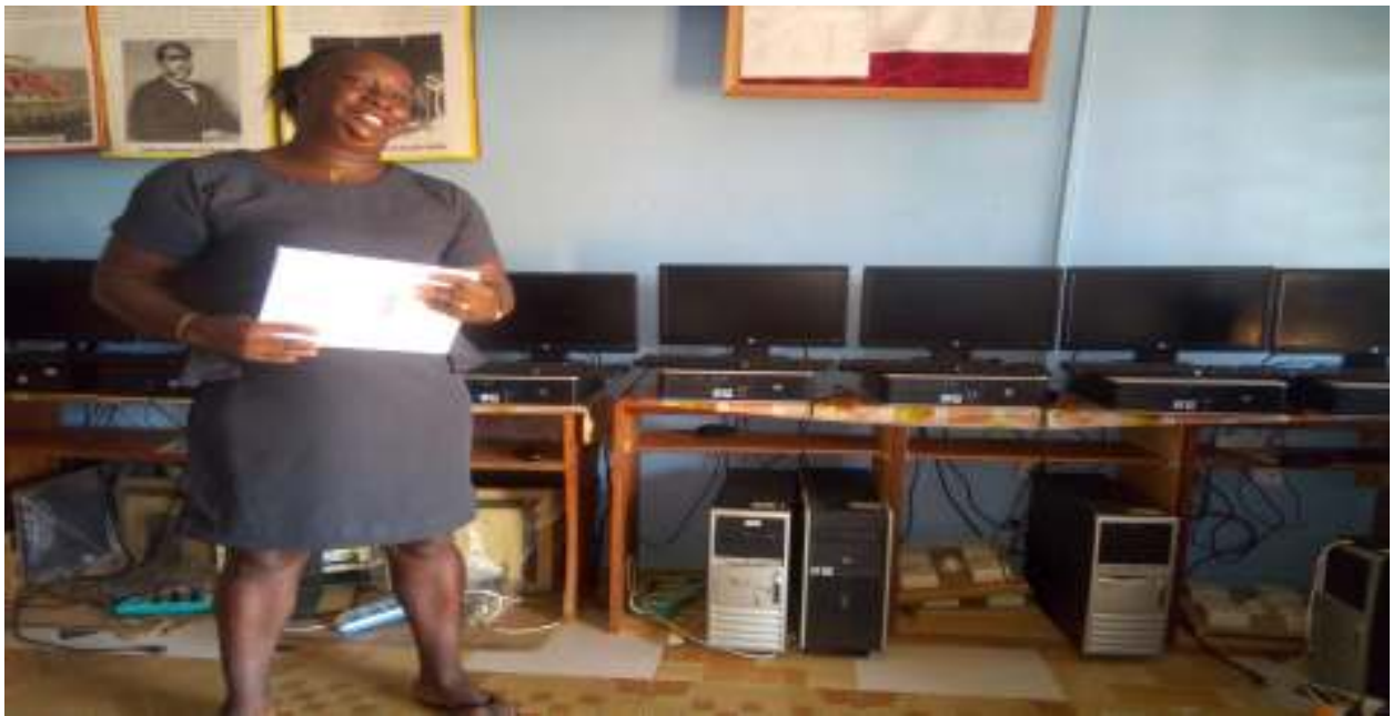
Coordinator (Headmistress of the school) for the Project