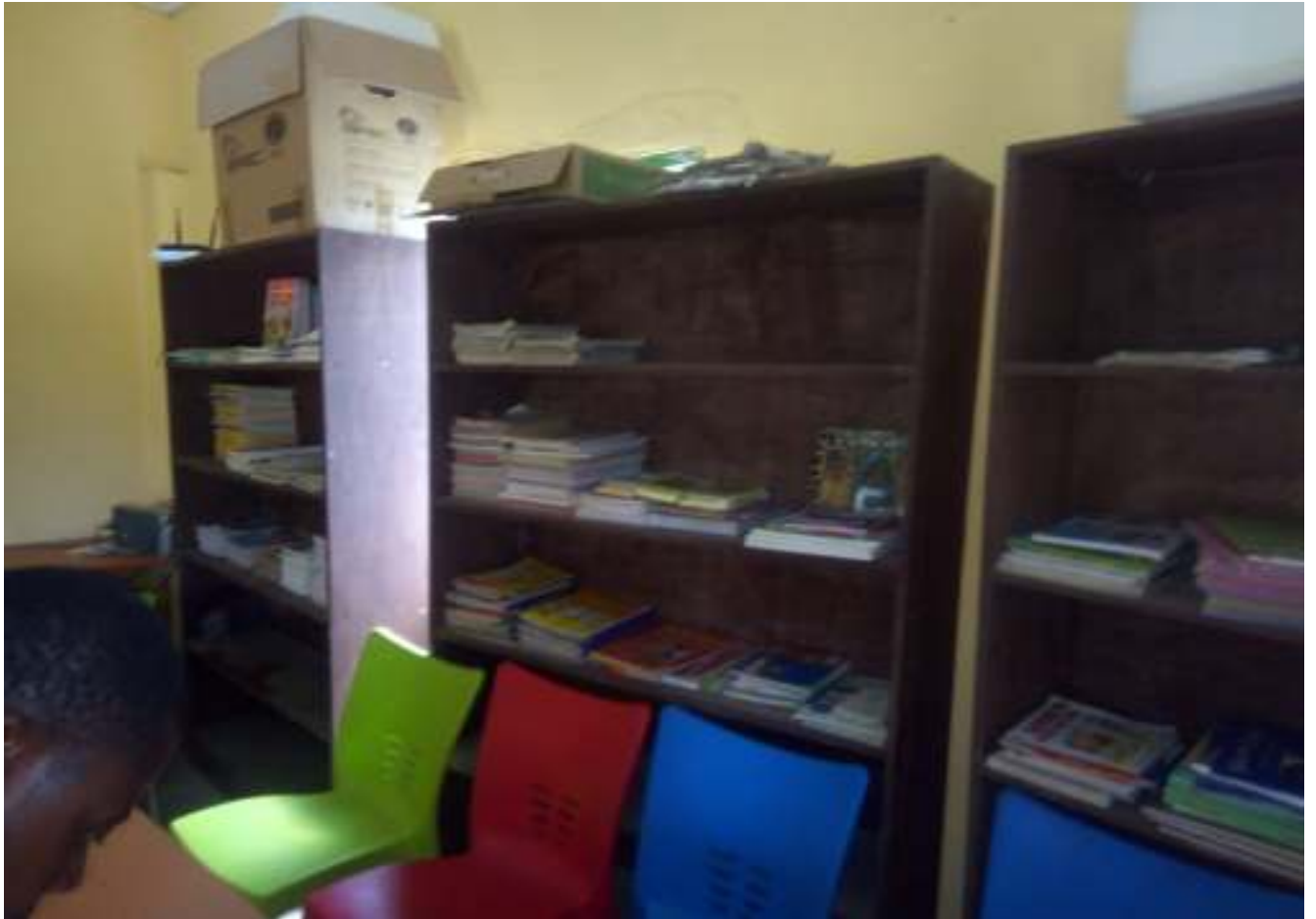
Reading Books provided by Ghanaman Trust Fund to Anakum Primary/JSS in the Western Region