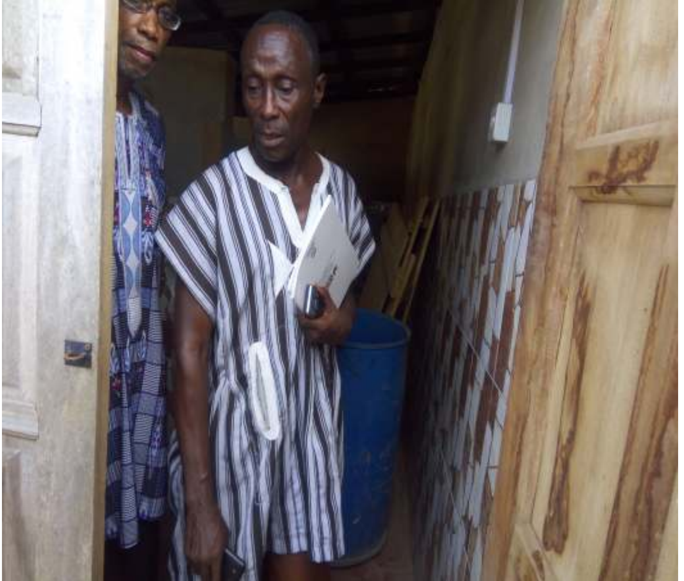
The Second Eight (8) seater Water Closet (W/C) at Kojokrom