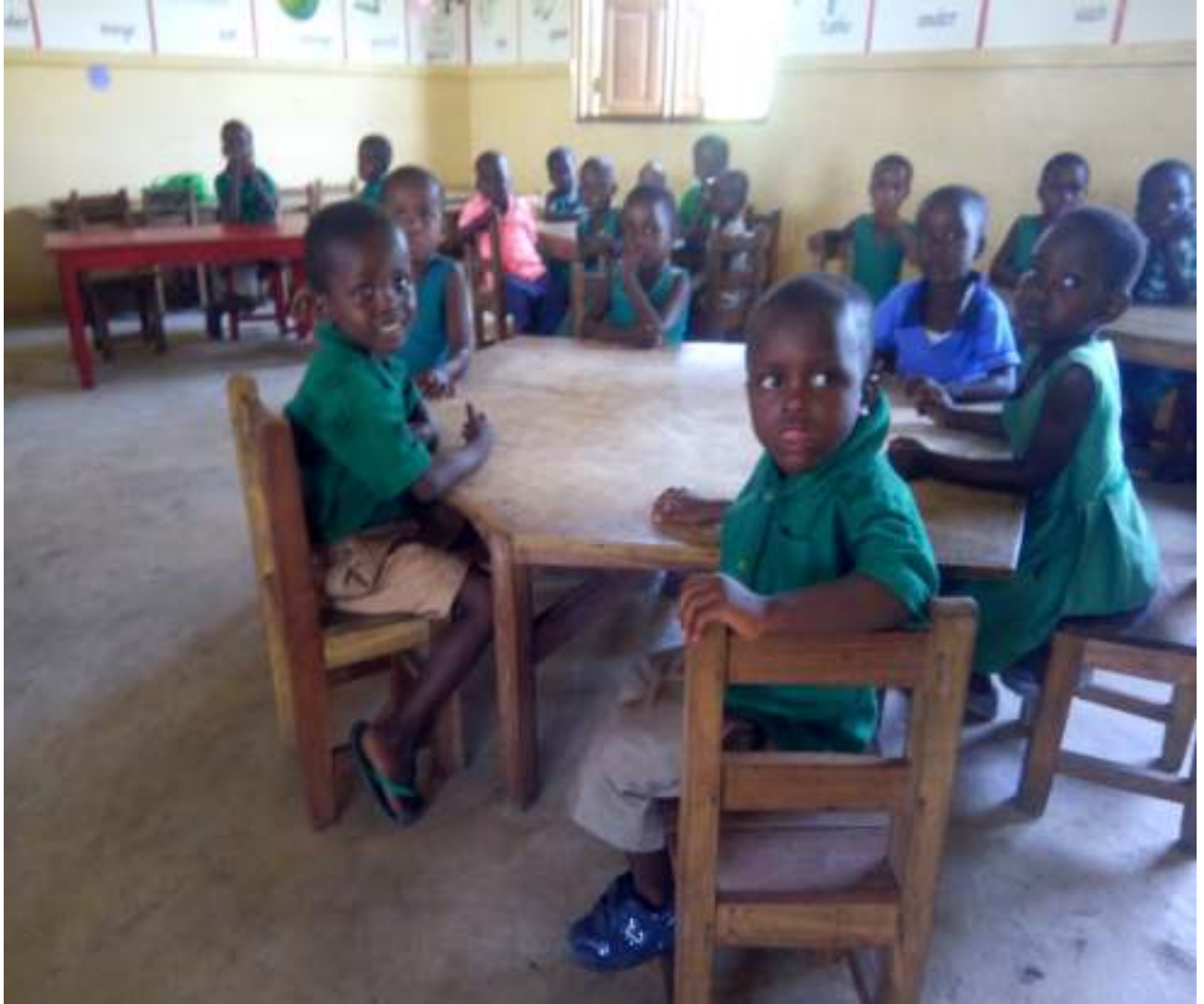
One of the classes of completed project being used by the KG Pupils