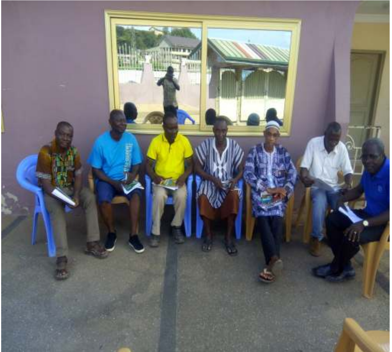
Some Committee Members in-charge of the Project and the Monitoring Team in a Group Picture