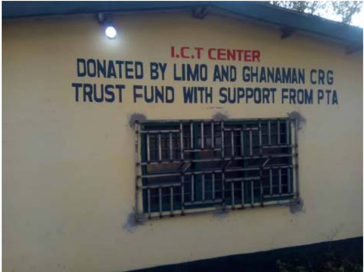
ICT Centre Block – Half Asini