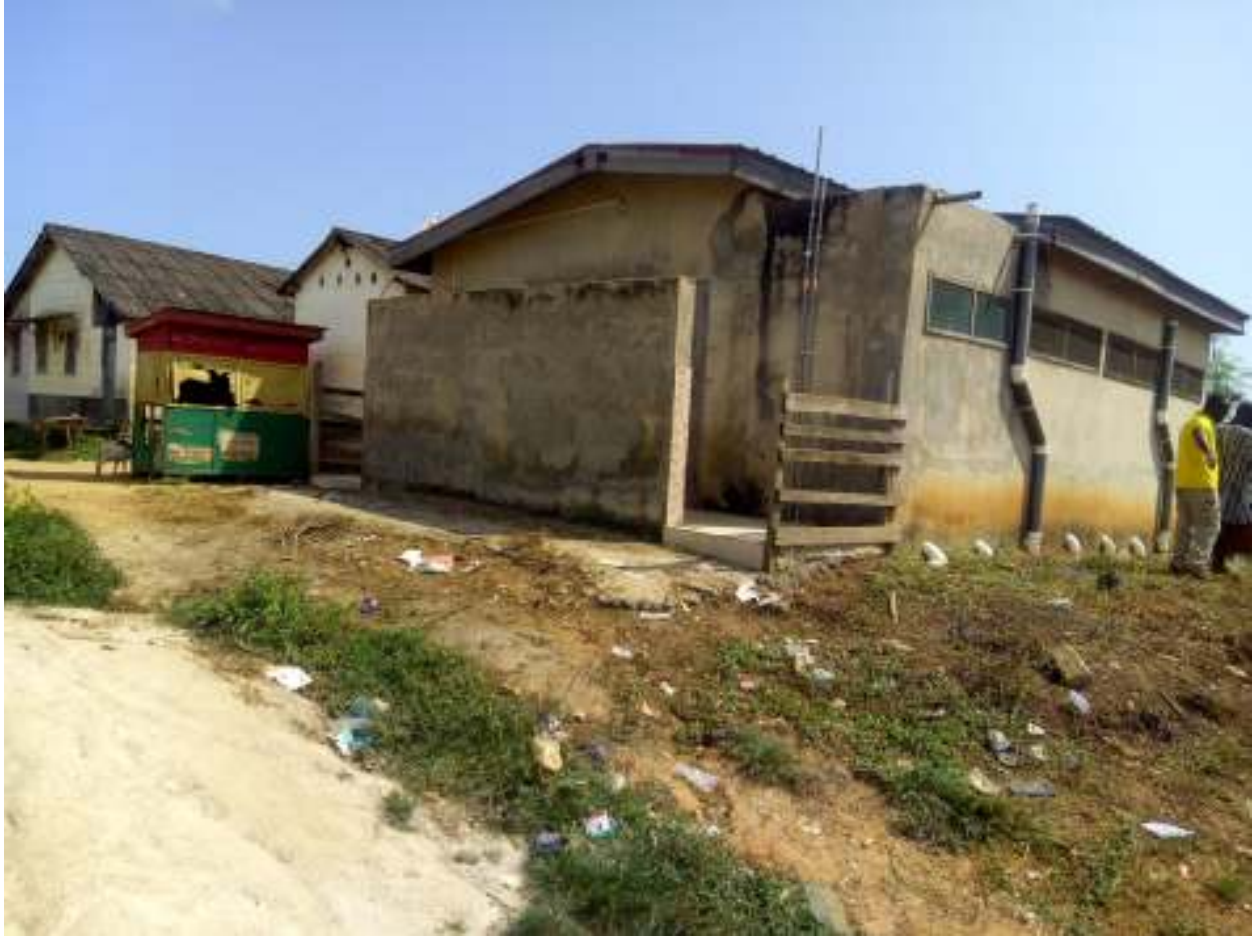
Full Structure of Sixteen (16) seater Water Closet (W/C) at Kojokrom