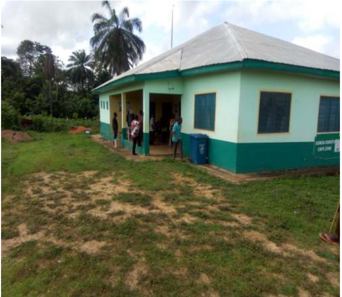
Gomoah Kokofu Community Completed Clinic Facility