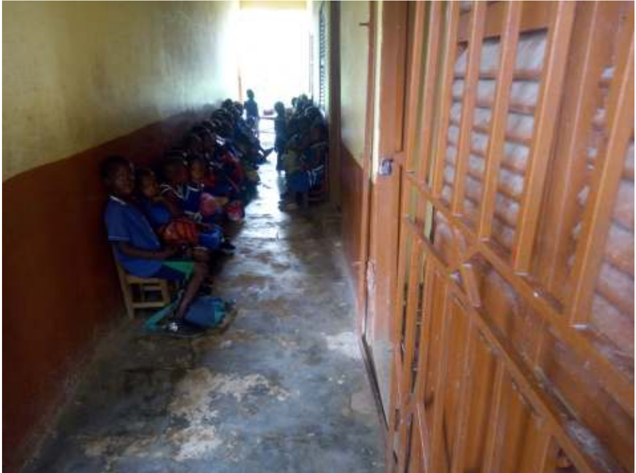
A section of the school pupils in a temporary structure-Kraboa Coaltar