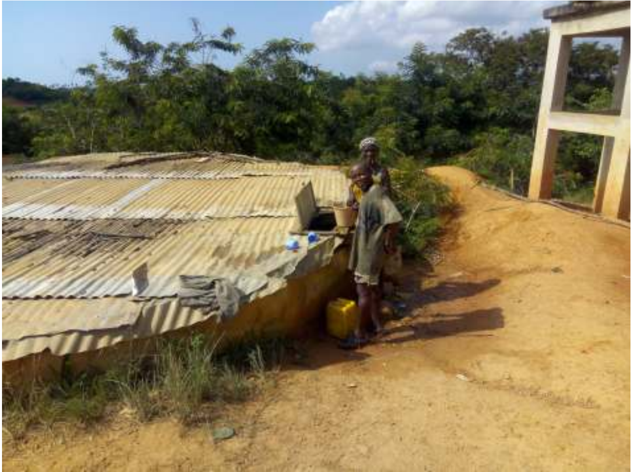
Water harvesting project- Kedzi ( Anlo Beach Resort) in the Shama District - WR