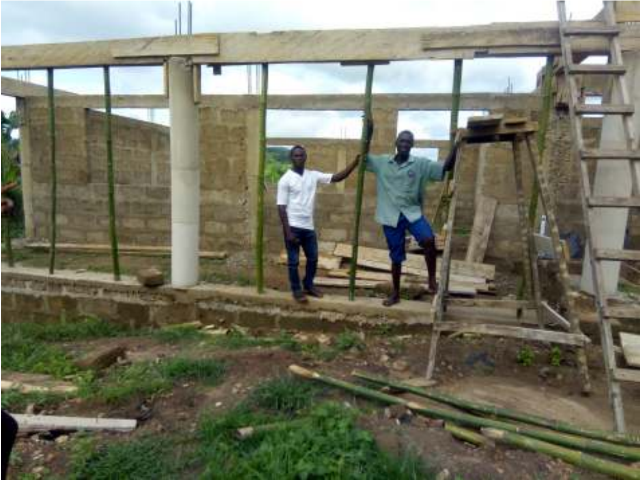
Building project at lentil level- Kraboa Coaltar