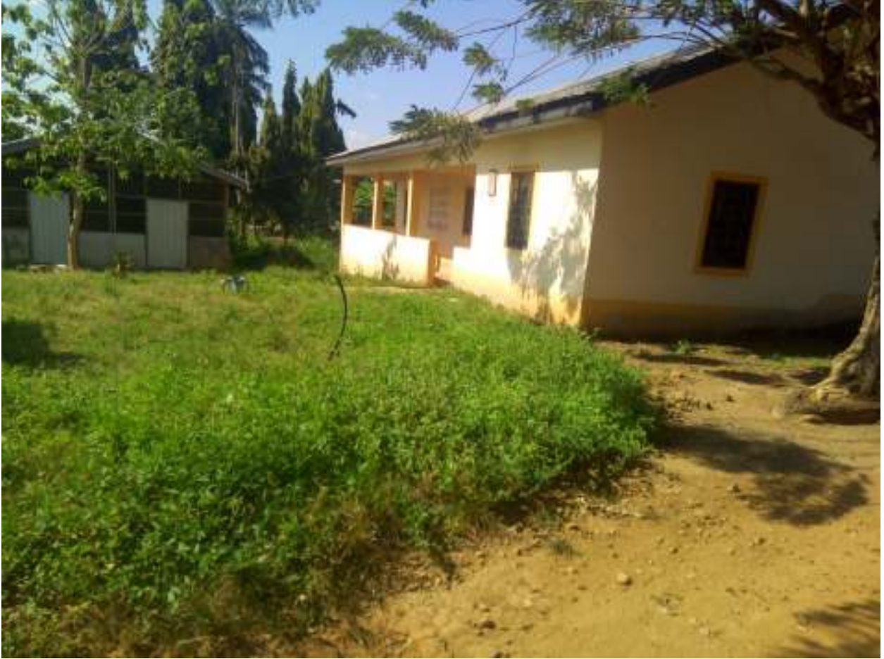
Adankraja CHIPs compound, Bekwai in the Ashanti Region