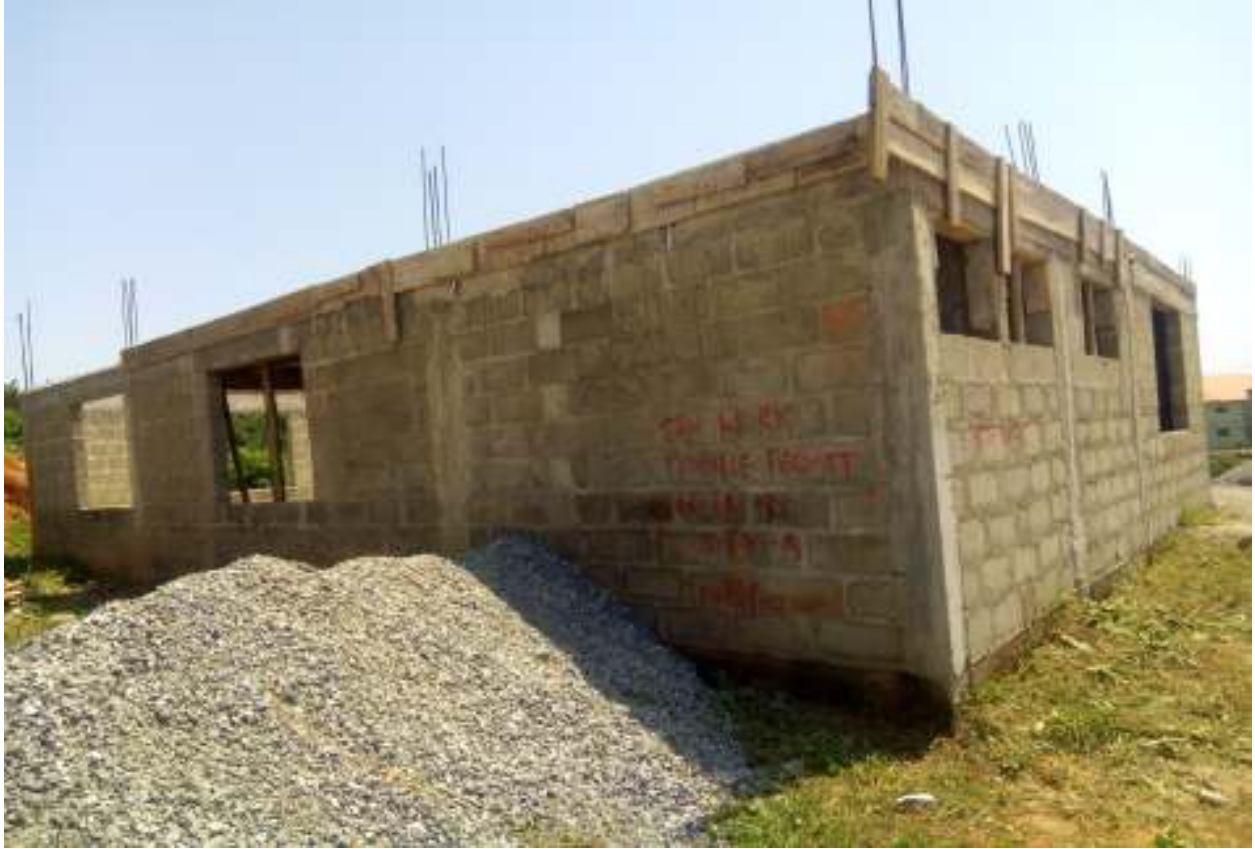
Ryner Paul Anglican School ICT Centre at Roofing Level