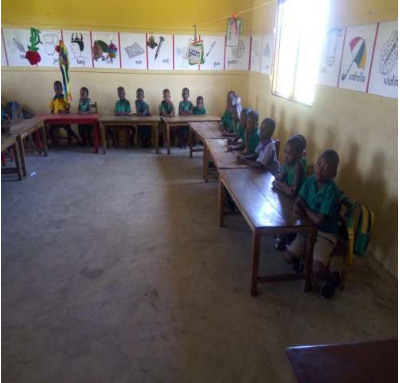
Another class of completed project being used by the KG Pupils