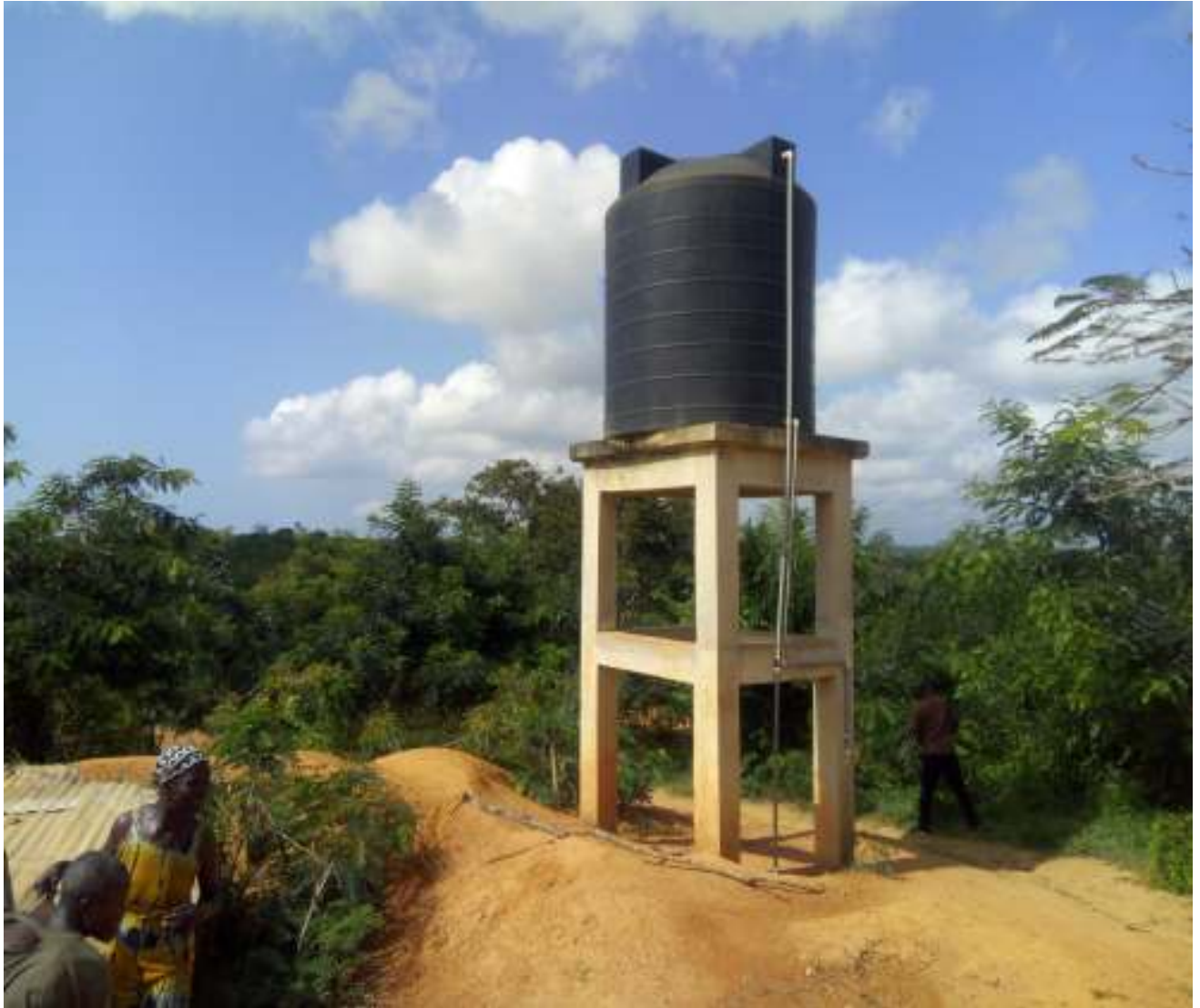
Water harvesting project- Kedzi ( Anlo Beach Resort) in the Shama District - WR