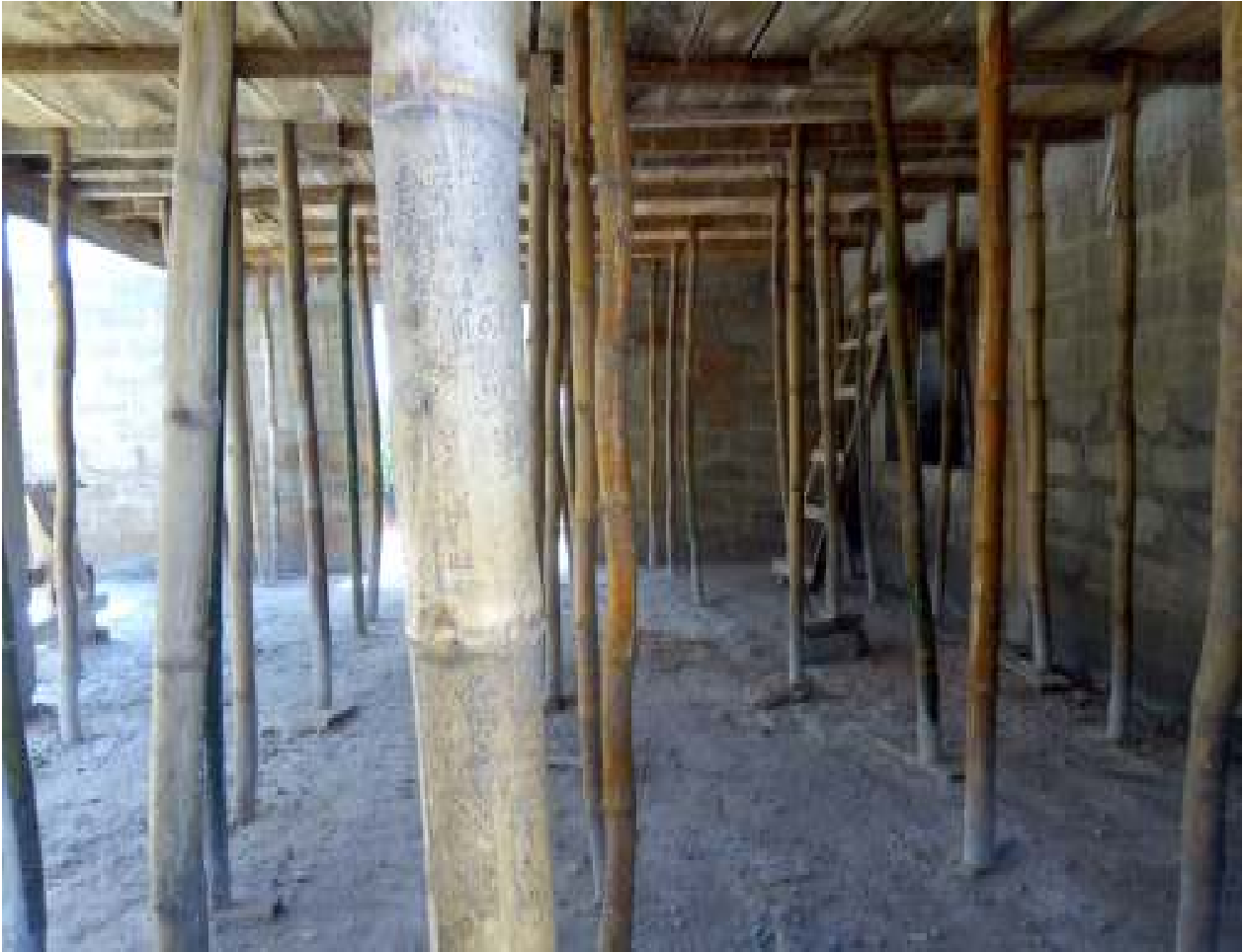
Ryner Paul Anglican School ICT Centre at Roofing Level