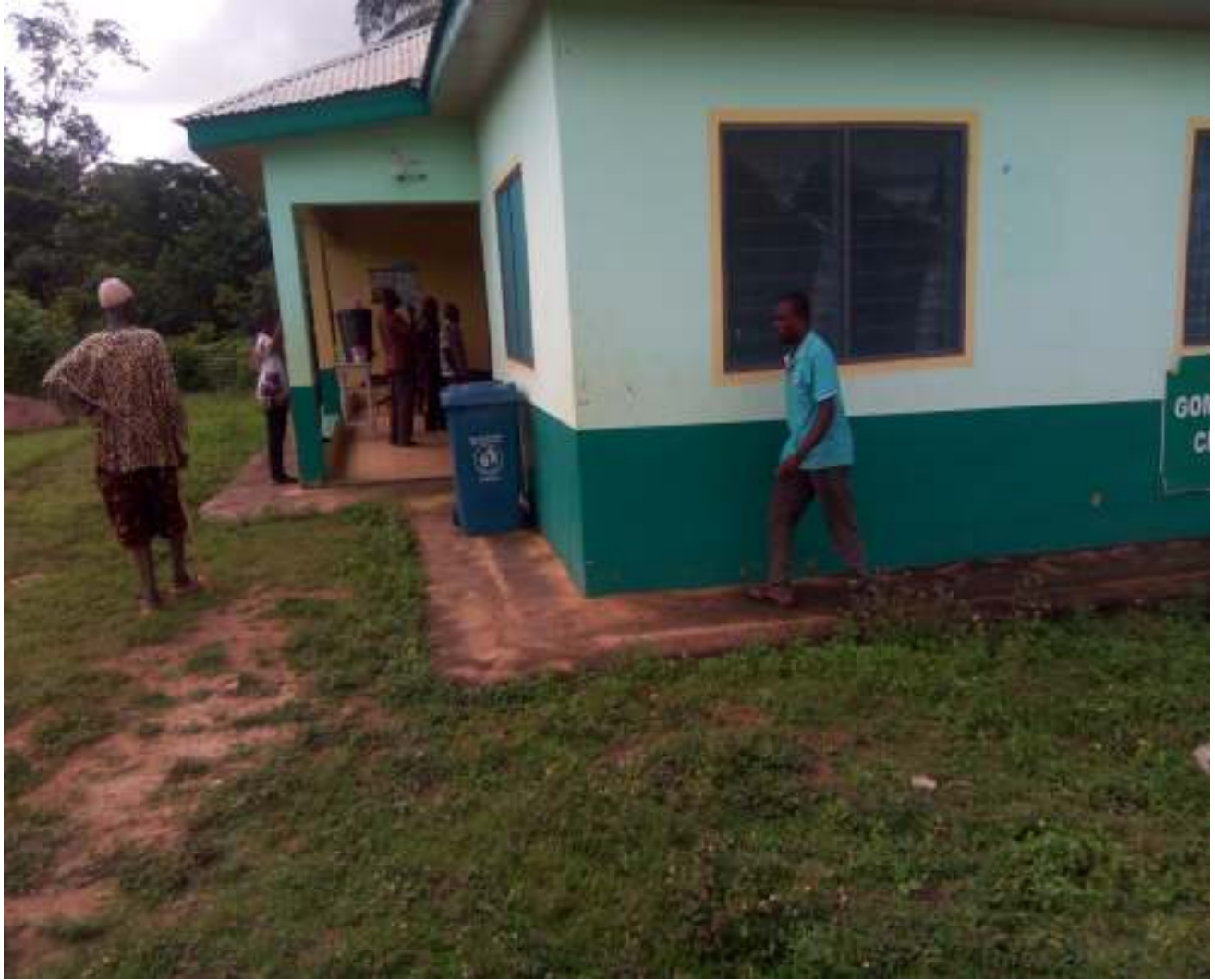
Gomoah Kokofu Community Completed Clinic Facility