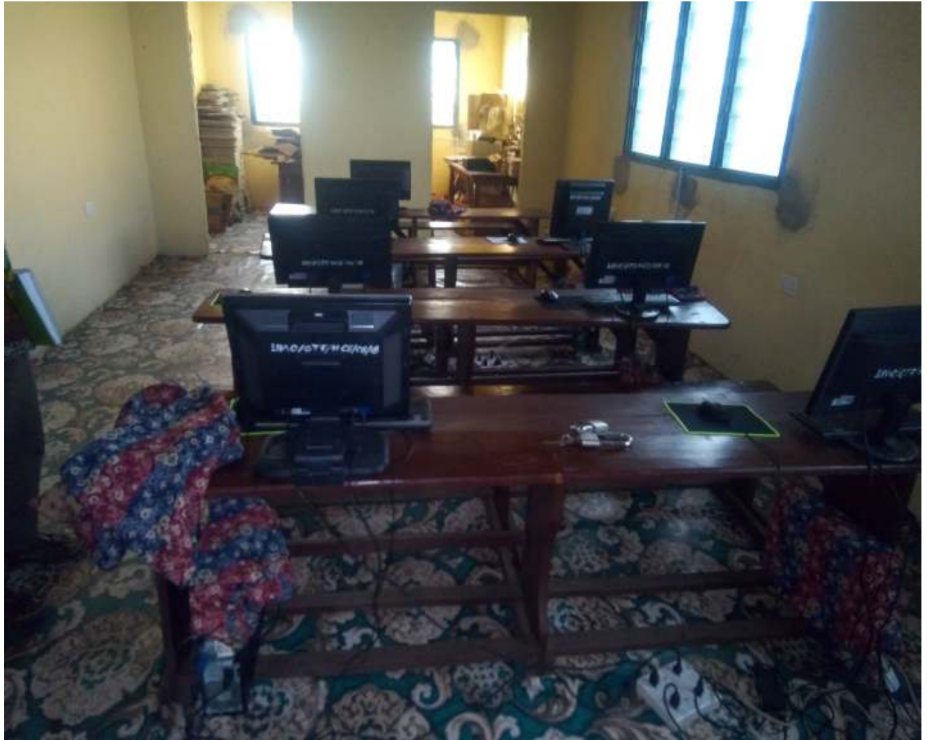
ICT Centre with Desk-Top Computers – Half Asini