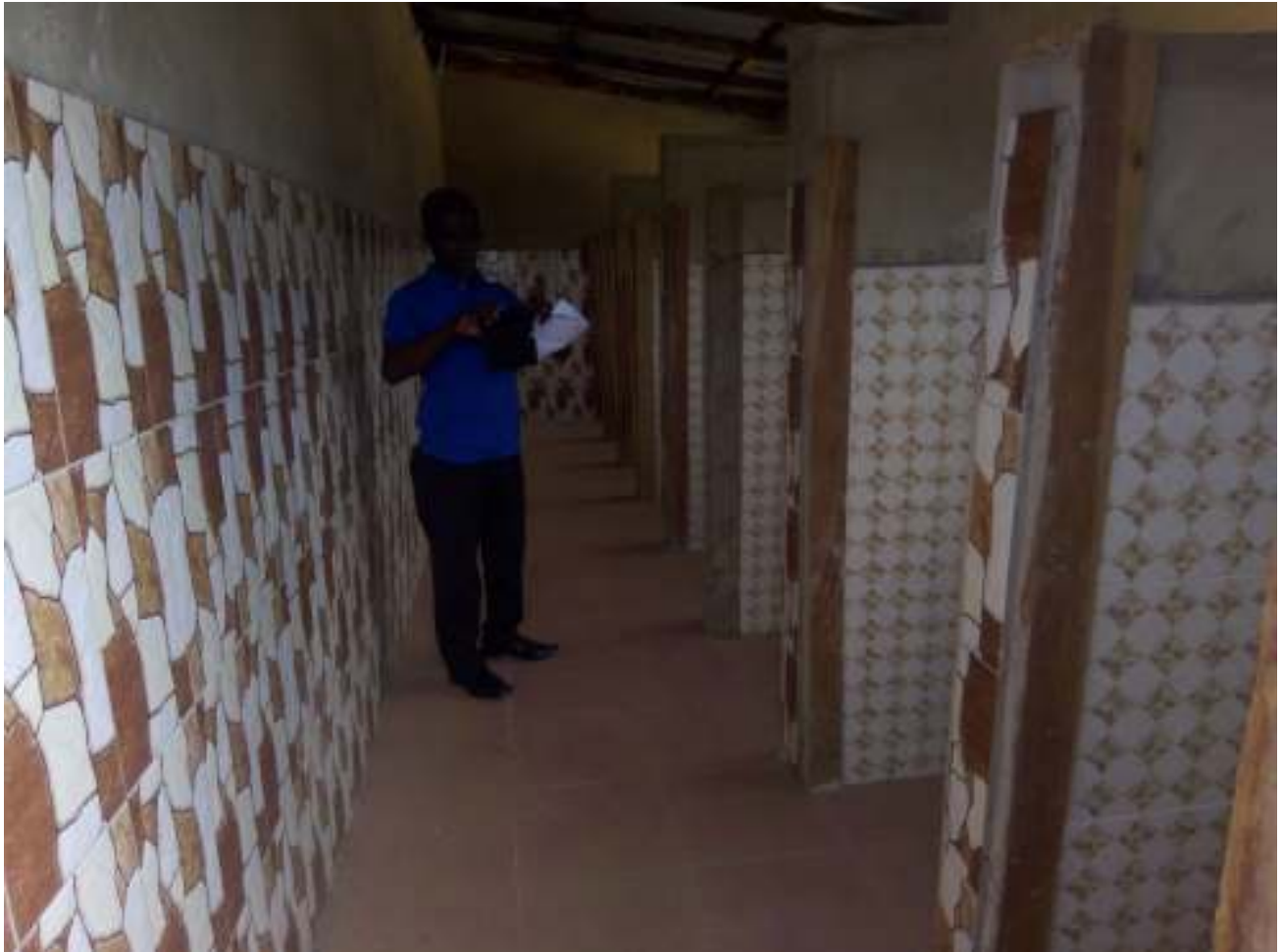
The First Eight (8) seater Water Closet (W/C) at Kojokrom